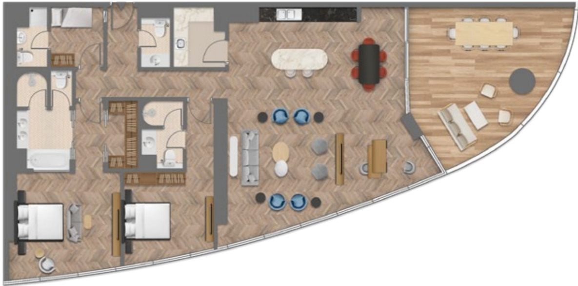
2 BEDROOM APARTMENT, TYPE B