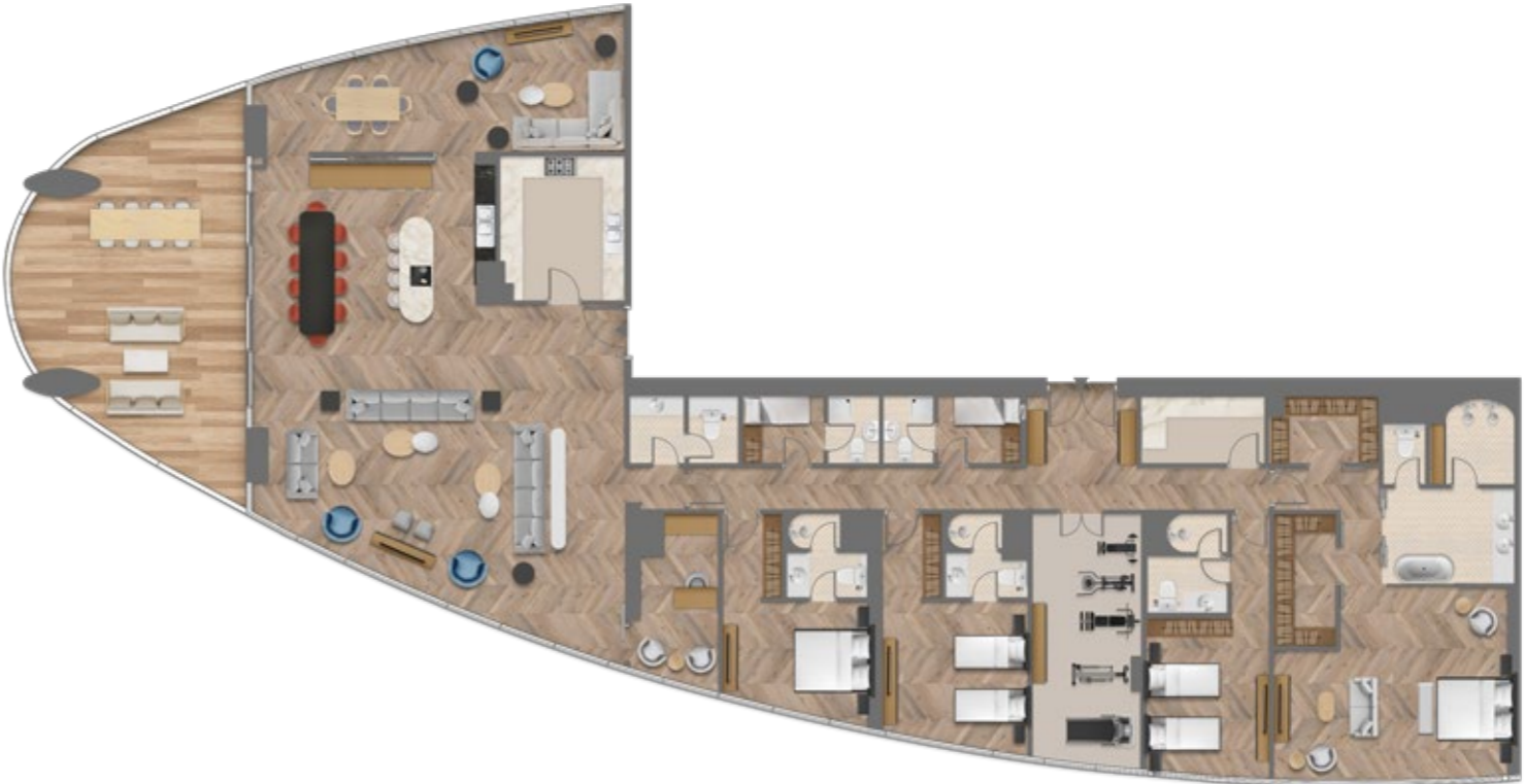
4 BEDROOM APARTMENT, SIMPLEX