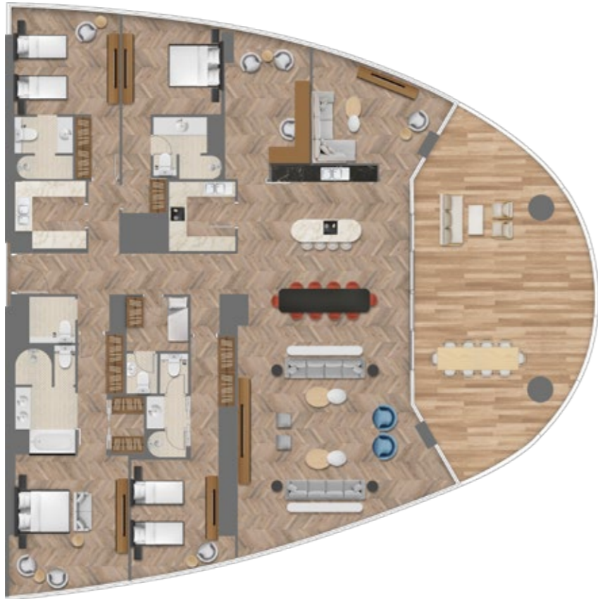
4 BEDROOM APARTMENT, TYPE A