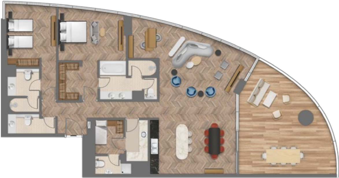
2 BEDROOM APARTMENT, TYPE A