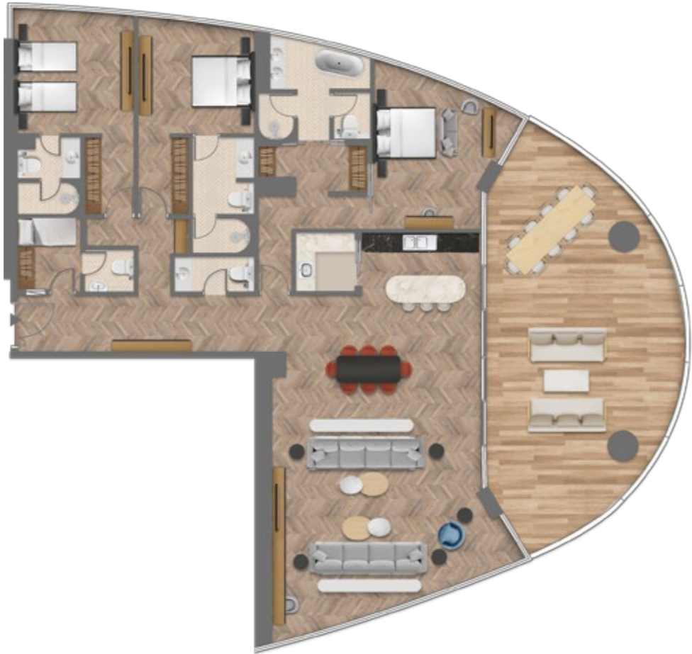
3 BEDROOM APARTMENT, TYPE B